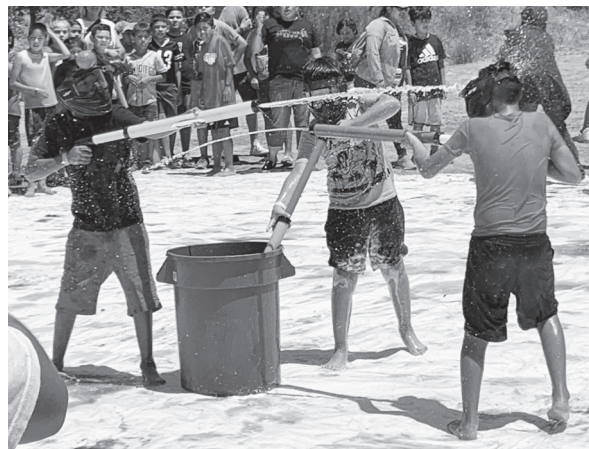
Water games are always a hit when camp is in August!