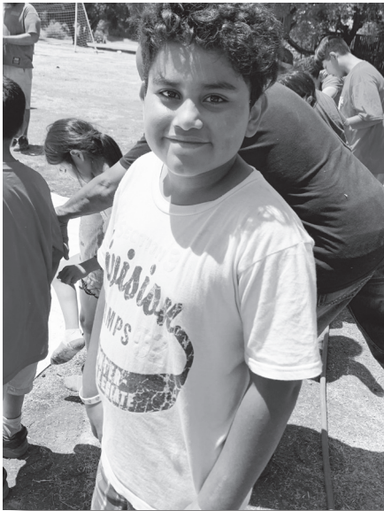
Kids were so thankful to be back to camp after having to miss 2020.

PS - We had a great camp August 6-8! Over 130 kids attended. Thank you to all who gave and prayed. To get a glimpse of what went on, go to our website spectrumministries.org and watch our camp video!