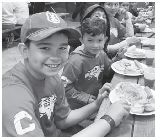
One of the things the kids often tell us is how much they love the camp food!