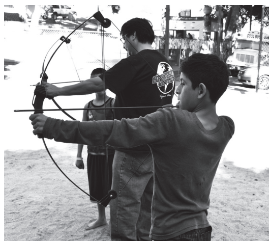
Camp is a great place for kids to try archery for the first time!

Spectrum Kid's Camp fits right in with what we want to accomplish as a ministry. It's been said that at the root of any kind of poverty is a lack of hope. Whether it be physical/financial, emotional, or spiritual poverty, if you've never seen anything outside of the dire situation you're in, the tendency is to give up hope that there's anything better. You succumb and go along with it rather than be inspired to go beyond it. Our desire is that a weekend of fun, good food, loving interaction and strong teaching from God's Word is enough for some of these precious kids to see something different. To open their eyes to God's loving kindness and goodness in a way that sparks hope and a desire to know Him.