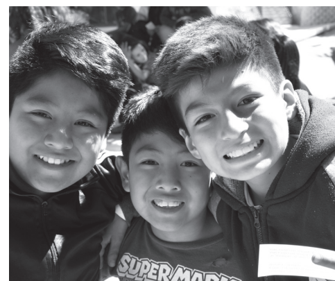
We sure are grateful to offer camp to these kids after missing it 2020!

In just a few short weeks (August 6-8) vans filled with 150 boys and girls from poor Tijuana neighborhoods and orphanages will make the hour and half trip south for a weekend outdoors at our annual Spectrum Kid's Camp. This trip is such a special time for our kids and was sorely missed in 2020. For some it will be the first opportunity in their lives to travel beyond the confines of their local neighborhood. It makes for a whole new experience to be surrounded by trees instead of graffiti covered buildings. One mom, speaking of her daughter, said, "It's something that I couldn't enjoy as a girl, and I love that she can!"