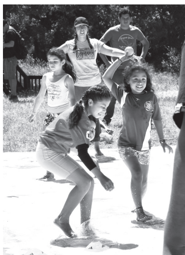
When the weather is warm, out come the water games!

In just a few short weeks (August 6-8) vans filled with 150 boys and girls from poor Tijuana neighborhoods and orphanages will make the hour and half trip south for a weekend outdoors at our annual Spectrum Kid's Camp. This trip is such a special time for our kids and was sorely missed in 2020. For some it will be the first opportunity in their lives to travel beyond the confines of their local neighborhood. It makes for a whole new experience to be surrounded by trees instead of graffiti covered buildings. One mom, speaking of her daughter, said, "It's something that I couldn't enjoy as a girl, and I love that she can!"