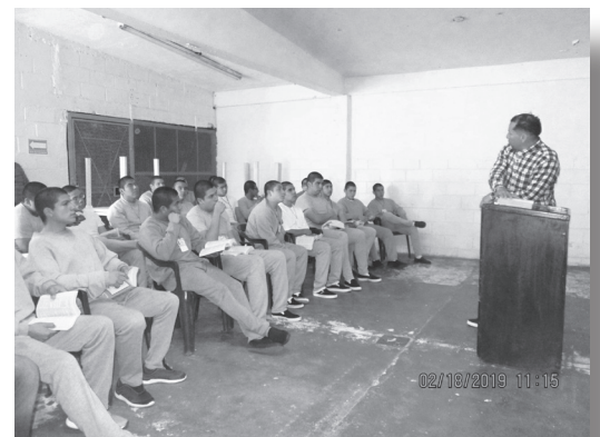
We bring in various teachers to share with the inmates throughout the retreat.

This is why I'm excited about our Spectrum Cemi retreat this November 23-24. It's the first retreat in almost two years due to Covid! Now the word "retreat" conjures up images of woods and cabins. Obviously that's an impossibility at the jail. So instead we bring the retreat to