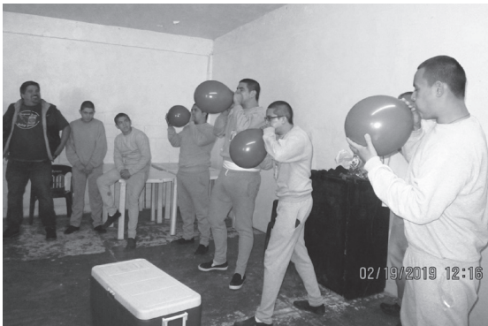
Sure the guys are a little old for balloons, but they get really competitive when it comes to games!

There are many factors any inmate could point to explaining how they found themselves behind bars. Some they didn't create and of course others, whether they want to admit it or not, came about by their own doing. Deep down though, each has moments they wish they could have back. Just like all of us!