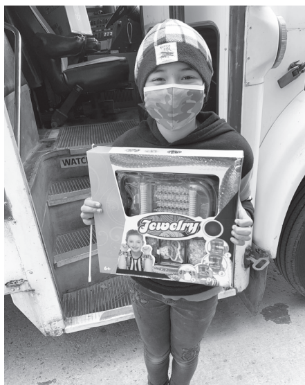
Last Christmas was different due to COVID protocols, but we were thankful we could gather the kids to receive their toys!

We received a recent email from our Christmas toy supplier in LA. They were notifying all of their customers that this year could be a struggle for their store to keep toys in stock due to the supply chain shortages that exist around the world. What does that mean for us at Spectrum? It means we need to bump up our time frame and buy early! We've really found a good situation working with this company. We can order good quality toys that our kids love for an average of only five dollars a toy. Multiply that by the 1,500 plus kids in our neighborhoods that come out for our events and the savings really add up! However, if the toys aren't in stock it's all for naught.