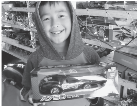
We're thankful for the quality of toys we're able to bring for the kids. It let's them know how special they are!