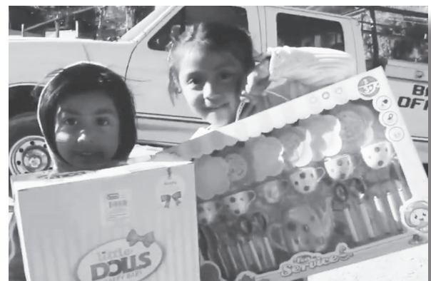
Praying we will have a new toy for every child who comes.

"For if, while we were God's enemies, we were reconciled to Him through the death of His Son, how much more, having been reconciled, shall we be saved through His life!" - Romans 5:10