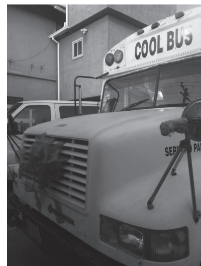
It's October and kids are already asking when the Cool Bus will be there.

So this year our challenge is shaping up to be the toy supply chain. Before the prices start to increase because of demand and prior to the shelves running bare, we're hoping to place our first order for toys by the end of October. Grateful doesn't begin to describe how I feel when I think of all the toys Spectrum has given out over so many years, and to think of how many of you have given to be a part of it. What God does with those five dollar toys in a kid's hand goes far beyond the month of December. It provides us opportunities to build relationships