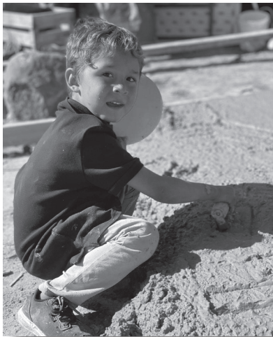
This was from a house we built in February. We love it when the families are able to help. Even the kids like to get in on the action!