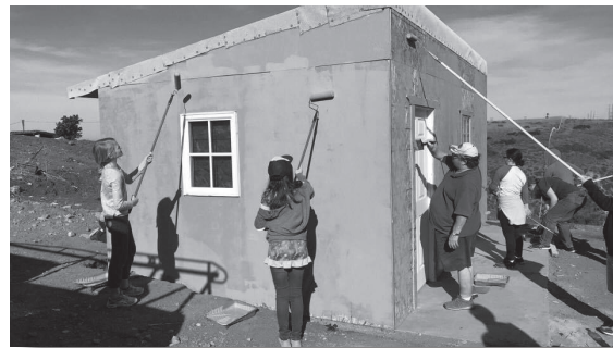
We're thankful for the groups and individuals who are able to come down and help us build!