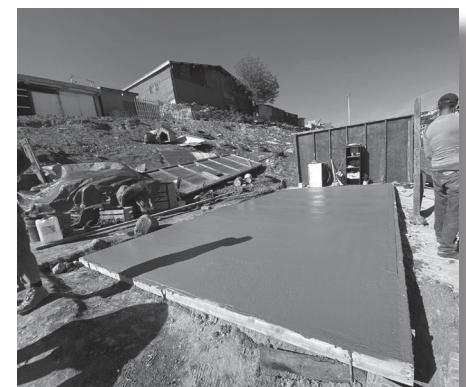
Having a firm foundation is always important.