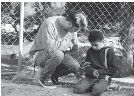
We work to continue to be there for kids from tough backgrounds to let them know we love them and so does Jesus!

"I will praise you, Lord among the nations; I will sing of you among the peoples, for great is your love, reaching to the heavens; your faithfulness reaches to the skies. Be exalted, O God, above the heavens; let your glory be over all the earth." - Psalm 57:9-11