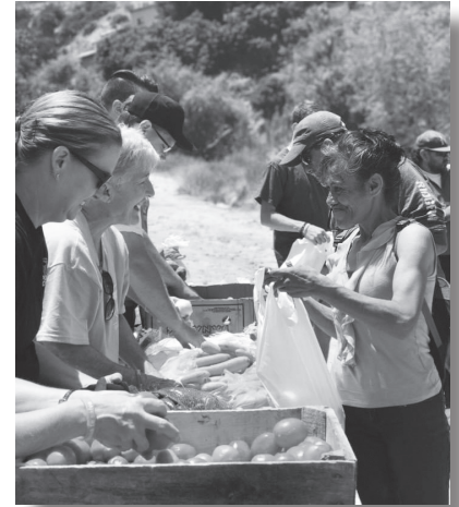
Providing opportunities to show God's love to those in need goes back to the origins of Spectrum.

PS - Thank you to everyone who participated and helped with the Christmas toy drive. We met our goal and passed out over 1,500 toys to kids in our communities! Please take a moment to watch our video by going to our spectrumministries.org home page to get a taste of how it went. Thank you!