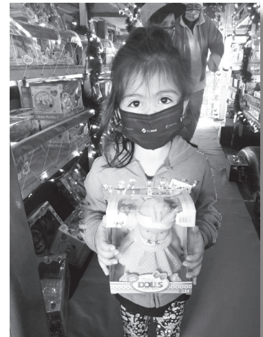
We're so grateful to be able to bring toys this Christmas! This girl loved her new doll!