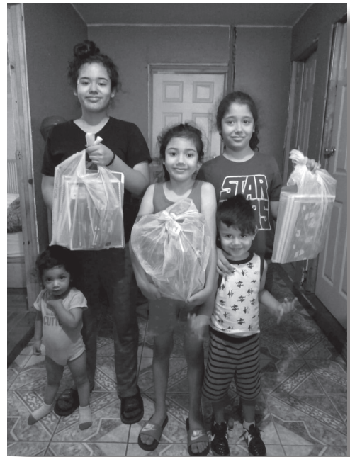
When families have multiple school age children, the costs can add up quick. Parents really appreciate our help with supplies.

PS - Plans are moving forward for kids camp this August! Please join us in praying that God leads and provides all we need for these kids to go to camp and learn about Him!