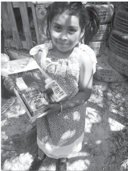
A year and a half of schools being closed was so long. May God help these kids to learn and catch up to where they need to be!