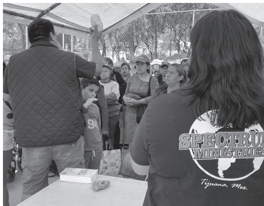
Looking forward to sharing the Gospel at our outreaches...

We recently received some very welcomed news. Tijuana is now under code “yellow”! The Mexican state of Baja throughout the pandemic has used the idea of a traffic light, or semaforo in Spanish, to illustrate the degree of imposed Covid restrictions. In mid January, at the height of the second wave the city was considered “red” and in full lockdown mode. Covid seemed to be everywhere and hospitals were at over eighty percent capacity. Since then, cases have plummeted and hospital occupancy for Covid patients is now only fifteen percent. Praise God! This drastic decrease has prompted officials to move to code “yellow” meaning proceed with caution. Restaurants, churches, etc will now open at fifty percent and gatherings can be up to twenty people. Definitely a step in the right direction!