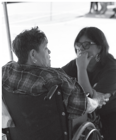
Looking forward to Conversations with people at our outreaches...

So now we find ourselves like drag racers, revving our engines, anticipating the light to turn “green”. Mind you, we will take our time and open things the right way. But we are excited, and with good reason. Our regular Spectrum programs will bring back opportunities for interactions we are so looking forward to!