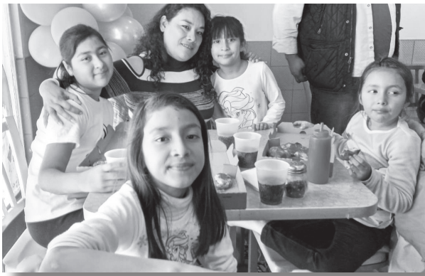
Looking forward to kids club outings...

Our weekly Kids Clubs sadly haven't been in operation for over a year now! We miss being able to provide a safe place for kids to have fun, hear a Gospel message, learn verses and sing songs. All inside the confines of a local church. Why is that important? Kids become familiar with what the church building is about and that it's a place for them. Prior to the pandemic, we were driving down into the neighborhoods to pick kids up and bring them on Sunday morning as well. All of that stemmed from their time at kids club. As the churches begin to re-open we look forward to starting that again. Our prayer is that their parents will join them!