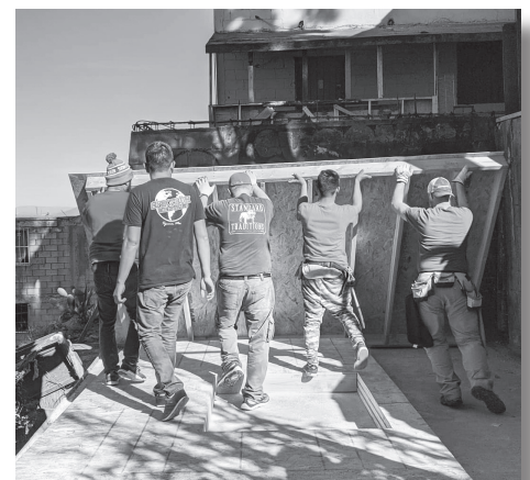
Looking forward to groups coming to serve...

greatly to hear the impact this ministry has made for the kingdom not just here in Mexico, but across the border in your life as well. How has God worked through Spectrum to add to the story He's telling in your life? We would love to hear it! You can write and send it our address or email us at info@spectrumministries.org . Thank you!