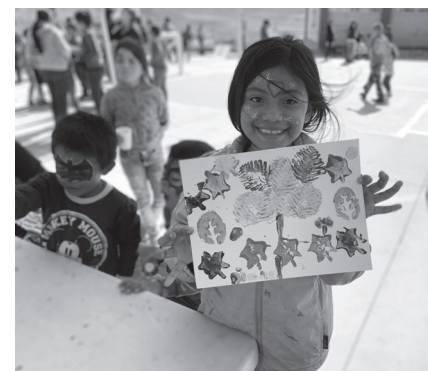
Looking forward to kids painting pictures...

Our door to door home deliveries of vegetables and groceries during the pandemic have been very effective in providing for those who are struggling, as well as for staying connected with the people we minister to. But it’s still not the same as our weekly outreaches . These draw hundreds of people together and provide local Tijuana churches a chance to serve and make connections in their communities. Groups from the States come as well to work alongside us and gain a heart for missions and God’s incredible love for the people of Mexico. During an outreach we have time to talk. Deeper conversations happen and windows of opportunities open to hear peoples’ stories and at the same time, share with them God’s story. At each outreach we get to meet new people as well, and kids always have a blast!