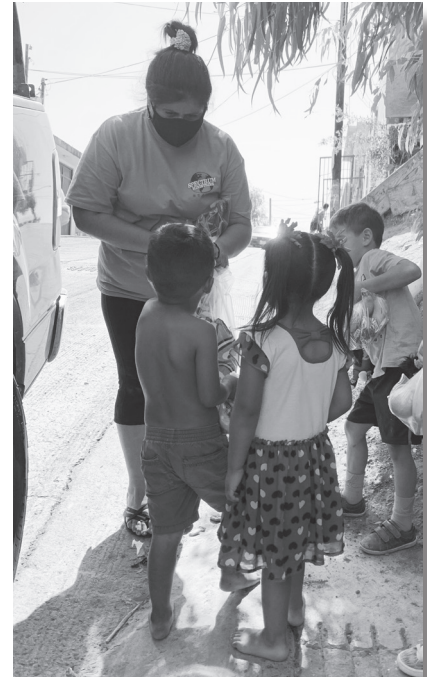
Through Spectrum's community work, Lily comes into contact with lots of kids, many of whom are healthy, but some who are in need of medical help.