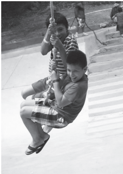
Planning and praying for an August kids camp!

PS - Due to the pandemic, we were unable to host our annual kids camp at the beginning of May. However hope is not lost! Our plan is to move it to August 6-8th! Stay tuned for more details in the months to come!